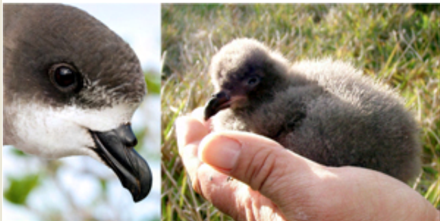
Cahow chick and adult.

A decoy Heermann's Gull and two cryptically-marked Heermann's Gull chicks at San Roque Island.