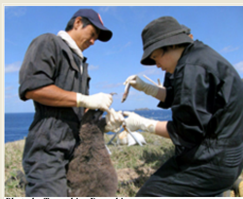
Hand-feeding a translocated Short-tailed Albatross chick at Mukojima Island.