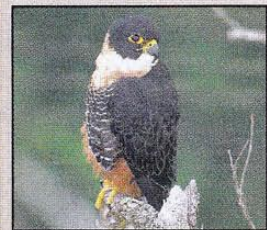
Photo: Orange-breasted Falcon

Comfortable and relaxed tours with great food, best accommodations and outstanding birding! All continental US trips below are guaranteed departures.